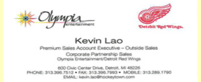
Kevin Lao '03